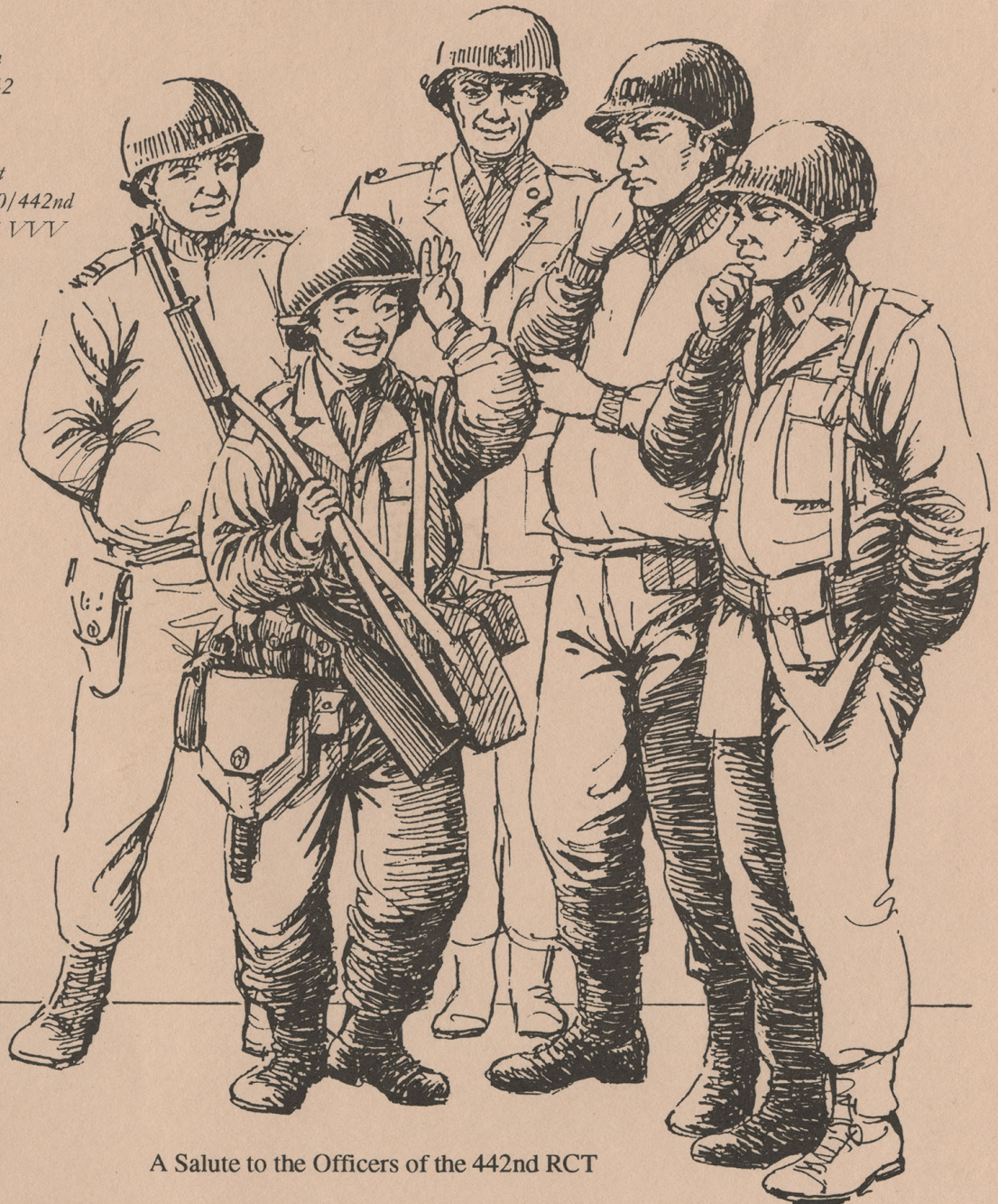
A Salute to the Officers of the 442nd RCT