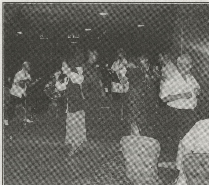
The "Nevada" Hawaiians" at the Las Vegas Banquet.

And so the 50th reunion of the 522FA Bn in history. May we enjoy many more reunions but please, no Las Vegas virus.