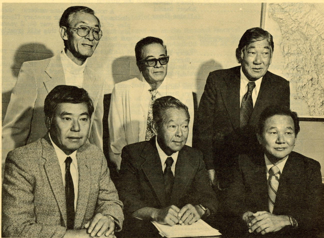
1979 OFFICERS, 442ND VETERANS CLUB