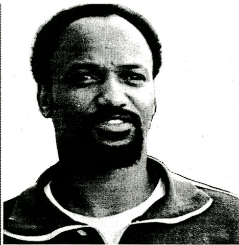
Geronimo Ji-Jaga Pratt has been held as a political prisoner for 17 years in a California Control Unit.

If it was simply a matter of the prison overseers identifying and sepa