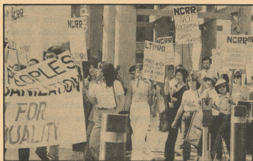
1982 Day of Remembrance Programs

On February 19, 1942, President Franklin D. Roosevelt signed Executive Order 9066, authorizing the incarceration of 120,000 people of Japanese ancestry into ten concentration camps. Forty years later, in 1982, Nikkei communities throughout the U.S. commemorated February 19 as the "Day of Remembrance".