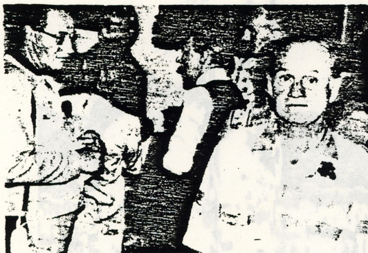
Frenchmen and Americans crowded into the Hotel Manx Red Room.