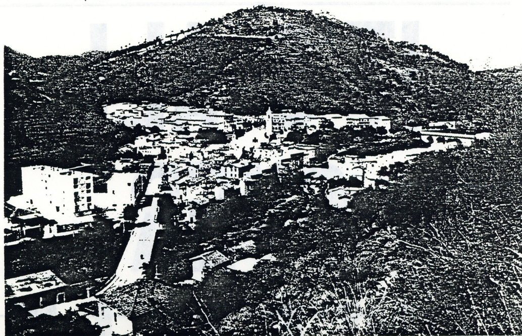
L'Escarene, Alpes Maritimes, France.