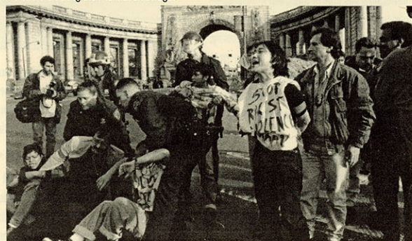
Police arresting peaceful demonstrators.